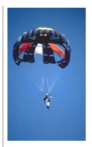
Eccentricity or lack of prudence should not be confused with lack of legal capacity.