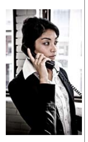
An adult child may contact your office to provide information about his or her parent, or to seek it.

card, saying to the parent: "That's wonderful to have such a helpful child. Let's you and me get together first and get acquainted, since you are the client. We'll call your daughter in if we need her." Generally, if the parent has sufficient capacity to engage legal representation, we won't need the child at all, and the dignity of both of them has been preserved.